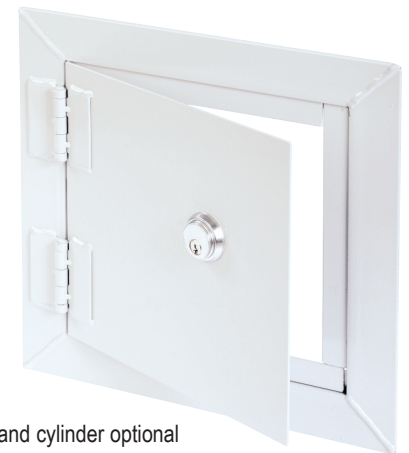
Lock and cylinder optional